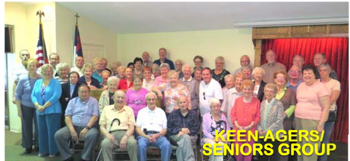
Meeting/Lunch/Entertainment Thursday, July 26th at 11:30

Independence Day is observed and celebrated this month. We are so blessed to live in a free nation. We should keep in prayer all people that live where they do not have the freedom that we all have had all our lives. God Bless the USA today and always.