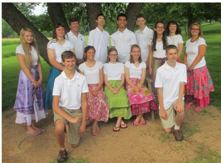
Western PA 1 & 2